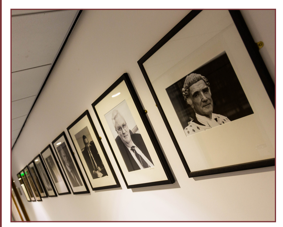
(Pictures depicting some of the former leaders of the Judicial Institute).

In order to measure whether we are achieving what we have set out in this document and in our business plan, we have identified the success criteria and key performance indicators in Figure 4. In Q1 2020, we will also commission a further academic audit of the Institute and an independent review of our digital provision, for delivery by 2021. This will be five years after the 2016 Genn Review and A6 Consultancy review of blended learning induction, and will take the first years of this strategy into account. The results will support the Institute in planning for the next period.